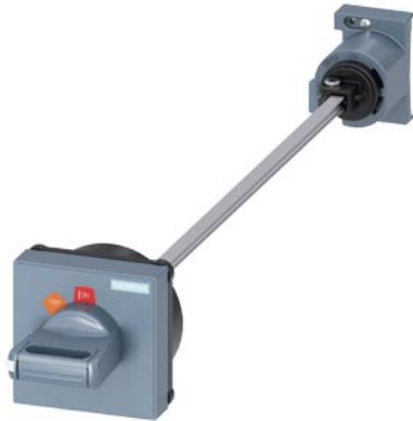
Door-coupling rotary operating mechanism For circuit breaker Size S00...S3, black 330 mm shaft