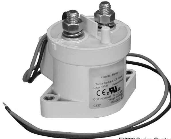
EV200 Series Contactor (CZONKA Relay, Type)