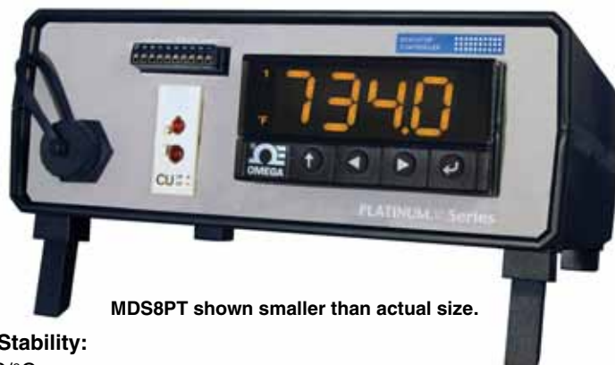
MDS8PT shown smaller than actual size.