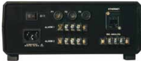
Single channel shown with dual alarm, ethernet, and isolated analog.

Power: 90 to 240 Vac, 50 to 60 Hz Note: Power cords for 120 Vac operation are available. See "Accessories."