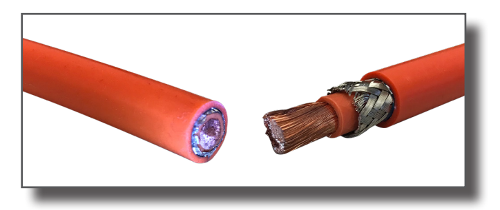
Process complex multi-layered HV cables in as fast as 30 Seconds!

For ease-of-use the HV-CP machine has an intuitive touch screen interface with a memory that accommodates up to 1,500 different profiles.