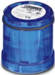
LED permanent light element, 24 V AC/DC, blue

Please be informed that the data shown in this PDF Document is generated from our Online Catalog. Please find the complete data in the user's documentation. Our General Terms of Use for Downloads are valid ( http://phoenixcontact.com/download )