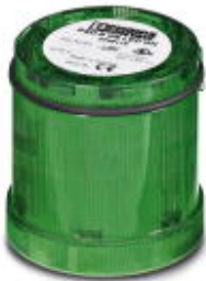
LED permanent light element, 24 V AC/DC, green

Please be informed that the data shown in this PDF Document is generated from our Online Catalog. Please find the complete data in the user's documentation. Our General Terms of Use for Downloads are valid ( http://phoenixcontact.com/download )