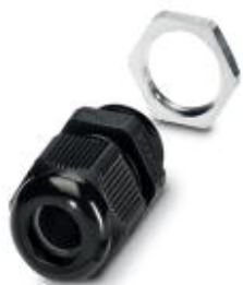
M16 cable threaded joint x 1.5 mm, black

Please be informed that the data shown in this PDF Document is generated from our Online Catalog. Please find the complete data in the user's documentation. Our General Terms of Use for Downloads are valid ( http://phoenixcontact.com/download )