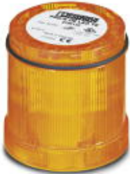
LED permanent light element, 24 V AC/DC, yellow

Please be informed that the data shown in this PDF Document is generated from our Online Catalog. Please find the complete data in the user's documentation. Our General Terms of Use for Downloads are valid ( http://phoenixcontact.com/download )