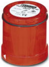
LED blinking light element, 24 V AC/DC, red

Please be informed that the data shown in this PDF Document is generated from our Online Catalog. Please find the complete data in the user's documentation. Our General Terms of Use for Downloads are valid ( http://phoenixcontact.com/download )