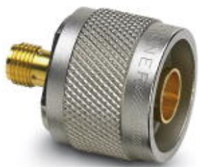
Antenna adapter, frequency range: 0.3 GHz ... 6 GHz, connection: N (male) -> SMA (female)

Please be informed that the data shown in this PDF Document is generated from our Online Catalog. Please find the complete data in the user's documentation. Our General Terms of Use for Downloads are valid ( http://phoenixcontact.com/download )