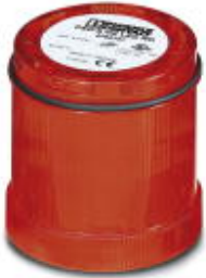
LED permanent light element, 24 V AC/DC, red

Please be informed that the data shown in this PDF Document is generated from our Online Catalog. Please find the complete data in the user's documentation. Our General Terms of Use for Downloads are valid ( http://phoenixcontact.com/download )