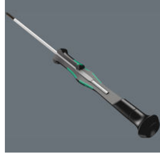
Multi-component screwdriver handle for ergonomic working.