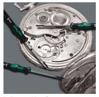
Indispensable for many users, including electronics technicians, opticians, precision engineers, jewellers, EDP hardware fitters and model-makers.