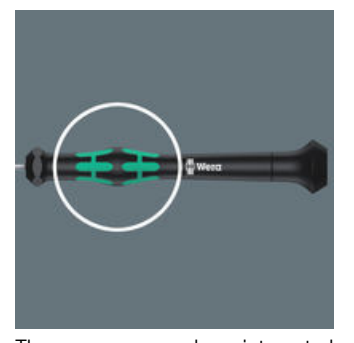
The power zone has integrated soft zones near the blade tip to ensure high torque transfer for loosening or tightening screws without losing contact with the screw.