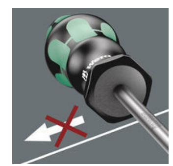
The hexagonal non-roll feature prevents any rolling away at the workplace.