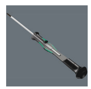
Multi-component screwdriver handle for ergonomic working.