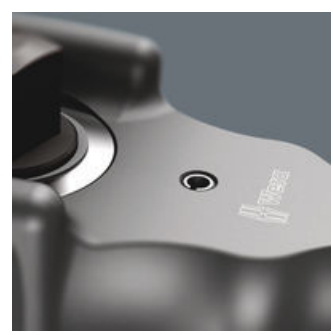
The drop-forged hammer head is permanently pinned to the shaft in a form-fit joint. This guarantees an almost non-detachable positioning of the hammer head on the handle.