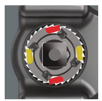
Gives the robust 30 saw teeth the precision engineering effect of 60 fine teeth with a 6° return angle.