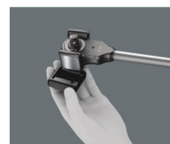
Used with rubber pad attachments to protect materials and surfaces.