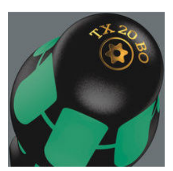
The screw symbol and tip size identification markings on the handle make it easier to find the right screwdriver in the tool case or at the workplace.