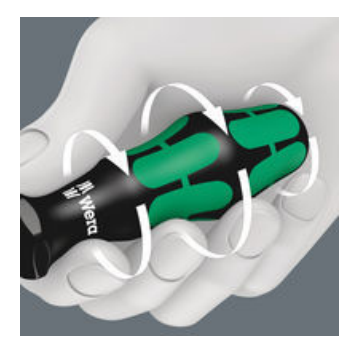
The hard materials used for the handle ensure rapid hand repositioning without any danger of the skin "sticking" to the handle. The surrounding hard zones with large diameters glide like wheels across the hand.