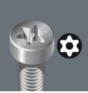
TORX® tools with a borehole prevent the unauthorised unfastening of safety screws. The screws contain a pin that protrudes into the drive profile so that "normal" TORX® tools cannot be used. This pin fits into the borehole of TORX® BO tools allowing safety screws to be unfastened.