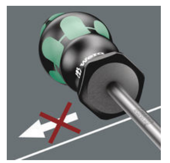
The hexagonal non-roll feature prevents any rolling away at the workplace.