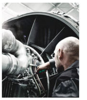
Kraftform Plus screwdrivers – ergonomics you can grasp. They relieve the entire hand-arm system even when used intensively. Along with other technical and product advantages such as the Lasertip for a secure fit in the screw head, Kraftform screwdrivers are the ideal choice whenever manual screwdriving jobs are concerned.