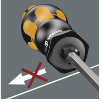
The hexagonal non-roll feature prevents any rolling away at the workplace.