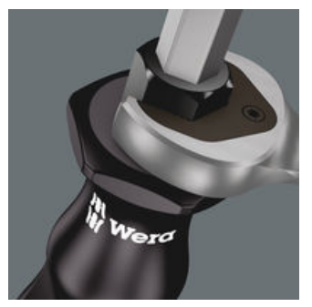
Greater torque can be transferred by fitting an open-jaw or ring spanner over the integrated hex bolster.