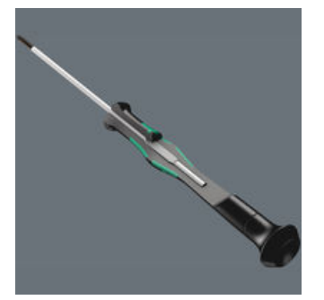
Multi-component screwdriver handle for ergonomic working.