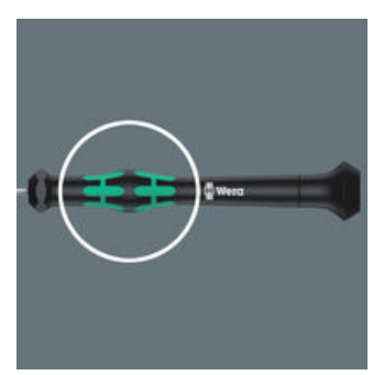
The power zone has integrated soft zones near the blade tip to ensure high torque transfer for loosening or tightening screws without losing contact with the screw.