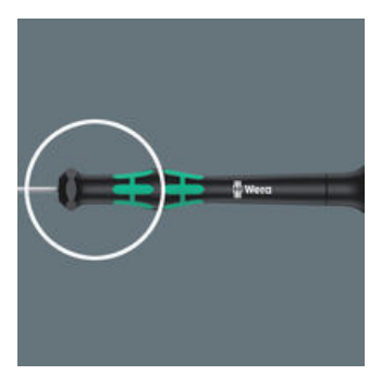
The precision zone directly above the blade gives the user a better feel for the right rotation angle during fine adjustment work.