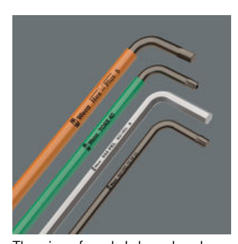
The size of each L-keys has been engraved by a laser. In addition SPKL L-keys have a colour coding according to sizes – for simple and rapid accessing of the required tool. Making it easy to find the right tool.