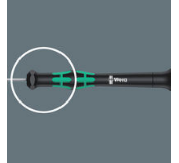
The precision zone directly above the blade gives the user a better feel for the right rotation angle during fine adjustment work.

The Kraftform Micro, with its three zones and their specific arrangement, satisfies these requirements perfectly. The freeturning cap that provides support for the hand works with these advantages, enabling quick and easy precision work.