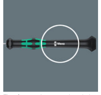
The fast-turning zone just below the rotating cap allows rapid twisting.