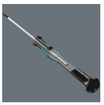
Multi-component screwdriver handle for ergonomic working.