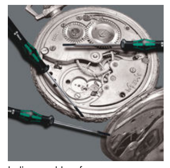
Indispensable for many users, including electronics technicians, opticians, precision engineers, jewellers, EDP hardware fitters and model-makers.