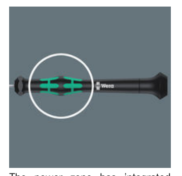
The power zone has integrated soft zones near the blade tip to ensure high torque transfer for loosening or tightening screws without losing contact with the screw.