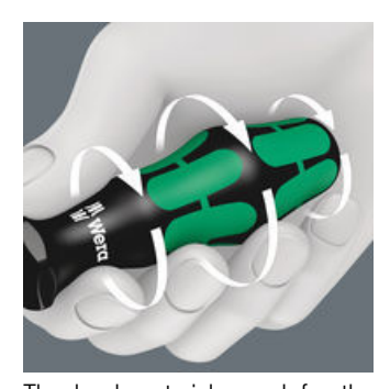
The hard materials used for the handle ensure rapid hand repositioning without any danger of the skin "sticking" to the handle. The surrounding hard zones with large diameters glide like wheels across the hand.