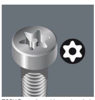
TORX® tools with a borehole prevent the unauthorised unfastening of safety screws. The screws contain a pin that protrudes into the drive profile so that "normal" TORX® tools cannot be used. This pin fits into the borehole of TORX® BO tools allowing safety screws to be unfastened.