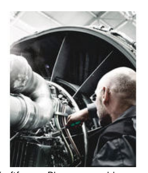
Kraftform Plus screwdrivers – ergonomics you can grasp. They relieve the entire hand-arm system even when used intensively. Along with other technical and product advantages such as the Lasertip for a secure fit in the screw head, Kraftform screwdrivers are the ideal choice whenever manual screwdriving jobs are concerned.