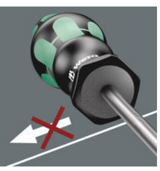
The hexagonal non-roll feature prevents any rolling away at the workplace.