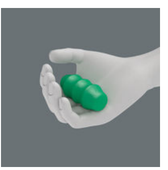
Kraftform Plus screwdrivers – ergonomics you can grasp. They relieve the entire hand-arm system even when used intensively. Along with other technical and product advantages such as the Lasertip for a secure fit in the screw head, Kraftform screwdrivers are the ideal choice whenever manual screwdriving jobs are concerned.

The basic idea for the prototype of the Kraftform handle - that the hand should dictate the design has, right through to today, proved to be correct. In cooperation with the internationally recognised Fraunhofer IAO Institute, Wera developed a screwdriver handle designed to match the shape of the human hand as long ago as 1960s. After a long the development phase, the Wera Kraftform handle was launched to the market in 1968. It has been optimised through the years with new technologies, but has kept its proven shape. After all, the human hand has not changed either.