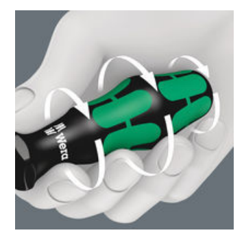
The hard materials used for the handle ensure rapid hand repositioning without any danger of the skin "sticking" to the handle. The surrounding hard zones with large diameters glide like wheels across the hand.