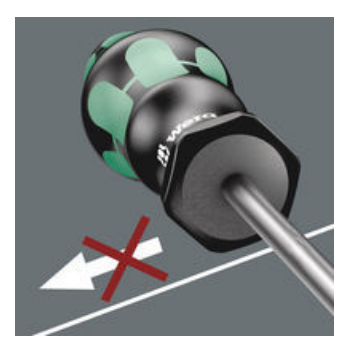
The hexagonal non-roll feature prevents any rolling away at the workplace.