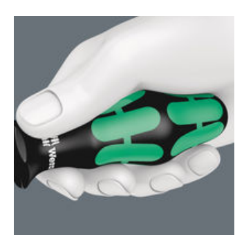
The large contact area – with particularly high friction to the soft zones – results in high torque transfer without any bruising from the edges.