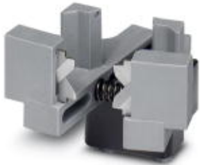
Replacement knife for the automatic stripping and crimping device CF 3000-2,5

Please be informed that the data shown in this PDF Document is generated from our Online Catalog. Please find the complete data in the user's documentation. Our General Terms of Use for Downloads are valid ( http://phoenixcontact.com/download )