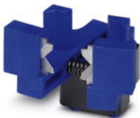
Replacement knife for the automatic stripping and crimping device CF 3000-2,5

Please be informed that the data shown in this PDF Document is generated from our Online Catalog. Please find the complete data in the user's documentation. Our General Terms of Use for Downloads are valid ( http://phoenixcontact.com/download )