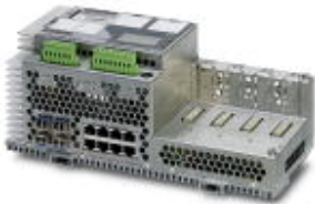
Gigabit Modular Switch with integrated routing function

Ethernet Gigabit Modular Switch with four 1000 Mbps combo ports and twelve 10/100 Mbps RJ45 slots, can be extended by an extension station to up to 24 ports, with integrated routing function