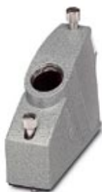
Powder-coated sleeve housing, with metric cable entry, locking screws with knurled head

Please be informed that the data shown in this PDF Document is generated from our Online Catalog. Please find the complete data in the user's documentation. Our General Terms of Use for Downloads are valid ( http://phoenixcontact.com/download )