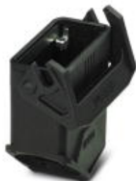
HEAVYCON EVO coupling housing, plastic, with bayonet flange for EVO screw connection, B10, with single locking latch, height: 90 mm, without EVO screw connection

Please be informed that the data shown in this PDF Document is generated from our Online Catalog. Please find the complete data in the user's documentation. Our General Terms of Use for Downloads are valid ( http://phoenixcontact.com/download )