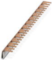
Wiring bridge for modules with connecting pitch 17.5 mm, 1-phase, 12-pos.

Please be informed that the data shown in this PDF Document is generated from our Online Catalog. Please find the complete data in the user's documentation. Our General Terms of Use for Downloads are valid ( http://phoenixcontact.com/download )