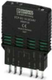
Electronic device circuit breaker, number of positions: 1, connection method: Screw connection, width: 12.5 mm, fuse type: electronic, fuse type: Automatic device, mounting type: on base element, Color: black

Please be informed that the data shown in this PDF Document is generated from our Online Catalog. Please find the complete data in the user's documentation. Our General Terms of Use for Downloads are valid ( http://phoenixcontact.com/download )