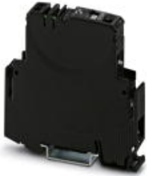
Electronic circuit breaker

Please be informed that the data shown in this PDF Document is generated from our Online Catalog. Please find the complete data in the user's documentation. Our General Terms of Use for Downloads are valid ( http://phoenixcontact.com/download )