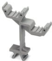
Double marker carrier, snaps onto the spring-cage terminal blocks ST 2.5..., labeled with ZB 5 or ZBF 5

Please be informed that the data shown in this PDF Document is generated from our Online Catalog. Please find the complete data in the user's documentation. Our General Terms of Use for Downloads are valid ( http://phoenixcontact.com/download )