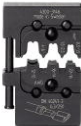
Die, for Crimpfox-M, for non-insulated slip-on sleeves 0.5 - 6 mm 2 , packed in a serial storage box

Please be informed that the data shown in this PDF Document is generated from our Online Catalog. Please find the complete data in the user's documentation. Our General Terms of Use for Downloads are valid ( http://phoenixcontact.com/download )