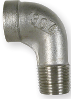
A-2025 Street Elbow: Female Pipe Thread by Male Pipe Thread