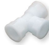
A-2007 Tees: Female Pipe Thread