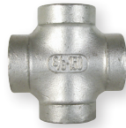
A-2020 Cross: Female Pipe Thread