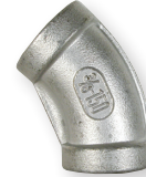
A-2023 Elbow: Female Pipe Thread, 45°