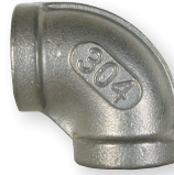
A-2022 Elbow: Female Pipe Thread, 90°