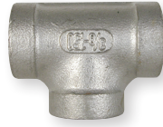
A-2026 Tee: Female Pipe Thread