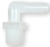
A-2003 Elbows: Male Pipe Thread by Hose Barb