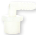
A-2004 Elbows: Female Pipe Thread by Hose Barb