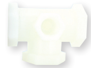
A-2008 Tees: Female Pipe Thread with 1/4" Gage Port