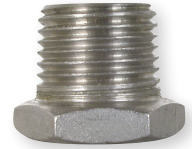
A-2024 Reducer Bushings