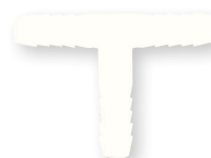
A-2016 Tees: Hose Barb