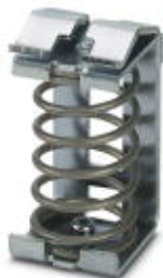
Shield connection terminal block, for applying the shield directly to the conductive mounting plates

Please be informed that the data shown in this PDF Document is generated from our Online Catalog. Please find the complete data in the user's documentation. Our General Terms of Use for Downloads are valid ( http://phoenixcontact.com/download )