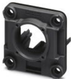
Panel mounting frame, IP67, for Freenet system, for round panel cutout, with grommet, without mounting screws, color: black

Please be informed that the data shown in this PDF Document is generated from our Online Catalog. Please find the complete data in the user's documentation. Our General Terms of Use for Downloads are valid ( http://phoenixcontact.com/download )