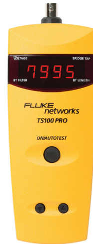
Open/short circuit detection – up to 8,000 feet (2,400 metres)