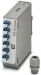
DIN rail splice box, fully mounted ready to splice, for 6x LC duplex (OS2)

Please be informed that the data shown in this PDF Document is generated from our Online Catalog. Please find the complete data in the user's documentation. Our General Terms of Use for Downloads are valid ( http://phoenixcontact.com/download )