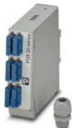
DIN rail splice box, fully mounted ready to splice, for 6x SC duplex (OS2)

Please be informed that the data shown in this PDF Document is generated from our Online Catalog. Please find the complete data in the user's documentation. Our General Terms of Use for Downloads are valid ( http://phoenixcontact.com/download )