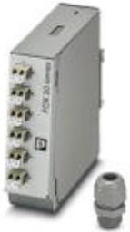
DIN rail splice box, fully mounted ready to splice, for 6x LC duplex (OM2)

Please be informed that the data shown in this PDF Document is generated from our Online Catalog. Please find the complete data in the user's documentation. Our General Terms of Use for Downloads are valid ( http://phoenixcontact.com/download )