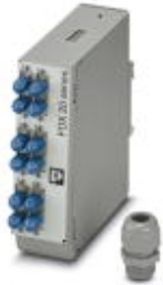
DIN rail splice box, fully mounted ready to splice, for 6x ST duplex (OS2)

Please be informed that the data shown in this PDF Document is generated from our Online Catalog. Please find the complete data in the user's documentation. Our General Terms of Use for Downloads are valid ( http://phoenixcontact.com/download )