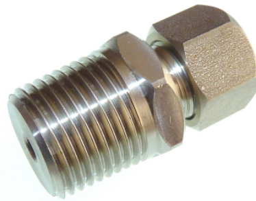
(BSPT tapered example – 286-787, see below for other sizes)