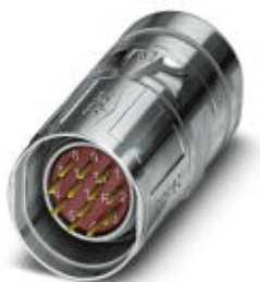
Cable connector, straight, shielded: yes, SPEEDCON locking, M23, No. of pos.: 17, type of contact: Pin, Crimp connection, cable diameter range: 3 mm ... 14.5 mm

Please be informed that the data shown in this PDF Document is generated from our Online Catalog. Please find the complete data in the user's documentation. Our General Terms of Use for Downloads are valid ( http://phoenixcontact.com/download )