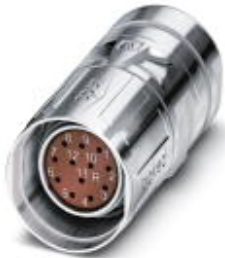
Cable connector, straight, shielded: yes, SPEEDCON locking, M23, No. of pos.: 12, type of contact: Socket, Crimp connection, cable diameter range: 10 mm ... 14.5 mm

Please be informed that the data shown in this PDF Document is generated from our Online Catalog. Please find the complete data in the user's documentation. Our General Terms of Use for Downloads are valid ( http://phoenixcontact.com/download )