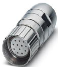
Cable connector, straight, shielded: yes, Screw locking, M23, No. of pos.: 6, type of contact: Socket, Solder connection

Please be informed that the data shown in this PDF Document is generated from our Online Catalog. Please find the complete data in the user's documentation. Our General Terms of Use for Downloads are valid ( http://phoenixcontact.com/download )