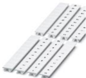
Zack marker strip, 10-section, horizontally labeled with the consecutive numbers: 411 ... 420, white, width: 8 mm

Please be informed that the data shown in this PDF Document is generated from our Online Catalog. Please find the complete data in the user's documentation. Our General Terms of Use for Downloads are valid ( http://phoenixcontact.com/download )