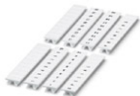
Zack marker strip, 10-section, horizontally labeled with the consecutive numbers: 41 ... 50, white, width: 5 mm

Please be informed that the data shown in this PDF Document is generated from our Online Catalog. Please find the complete data in the user's documentation. Our General Terms of Use for Downloads are valid ( http://phoenixcontact.com/download )