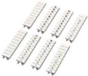
Zack marker strip, 10-section, vertically labeled with the consecutive numbers: 411 ... 420, white, width: 5 mm

Please be informed that the data shown in this PDF Document is generated from our Online Catalog. Please find the complete data in the user's documentation. Our General Terms of Use for Downloads are valid ( http://phoenixcontact.com/download )