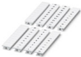
Zack marker strip, 10-section, vertically labeled with the consecutive numbers: 41 ... 50, white, width: 5 mm

Please be informed that the data shown in this PDF Document is generated from our Online Catalog. Please find the complete data in the user's documentation. Our General Terms of Use for Downloads are valid ( http://phoenixcontact.com/download )