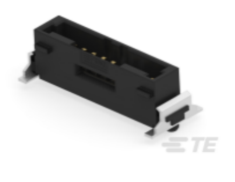
TE Part #474819-E SRCP 1,27 10 M 1-KS SMD 137 E1 094 * GU-